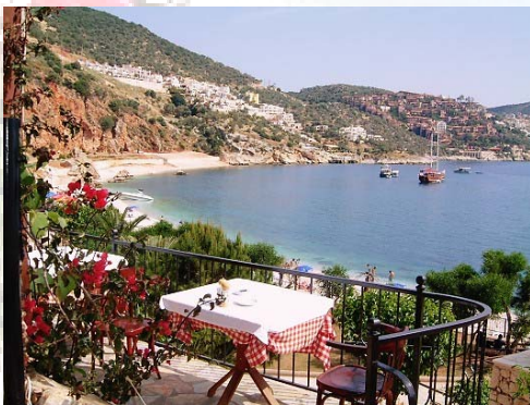
(A table for 2 by the sea)

Kalkan is renowned for its high quality, reasonably priced restaurants and friendly people. The heart of Kalkan is its old town, incorporating a maze of quaint cobbled streets which meander their way down to the picturesque harbour. Old Ottoman and Greek houses, with ornate wooded balconies and trailing bougainvillea only add to the charm of the lovely village atmosphere. You will find small boutiques, intimate bars and roof top restaurants all mingling together, which at night time, set the scene for a truly memorable evening