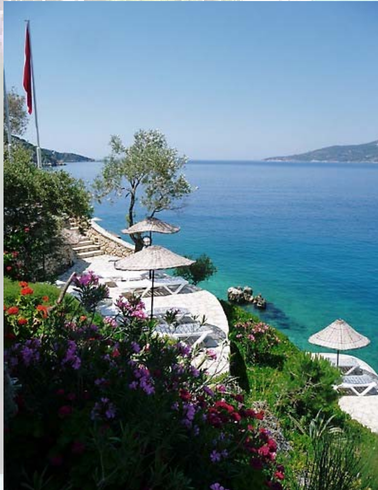
(Private Bathing Platforms- Club Patara)

Unwind and enjoy a relaxing holiday in a truly beautiful location. Bab Firdaus is your own secret hideaway. This spacious, airy apt is superbly appointed with all modern comforts. Why not eat your breakfast/lunch or relax for a pre-dinner drink on the bougainvillea laden front terrace and be amazed at the views, as you gaze across the harbour to Kalkan below. Views to inspire, especially at night time!