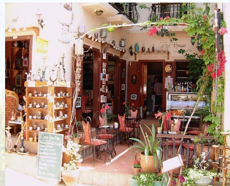
(Café Del Mar – over 100 types of coffee served here)