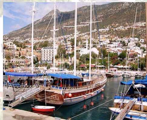
(Kalkan's pretty harbour)