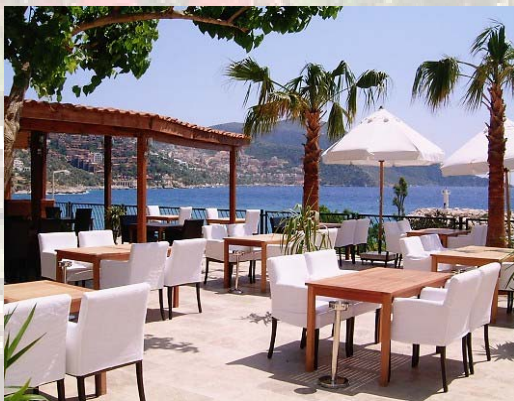
(Choose from over 80 restaurants)